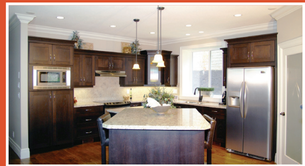
Domae Enterprises Summit Residences Inc.